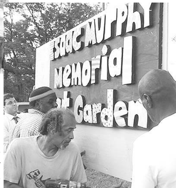
The Isaac Murphy Memorial Art Garden